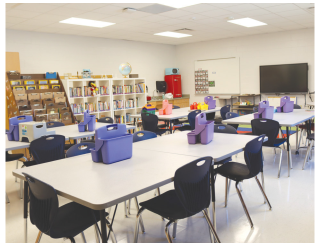
Russell Boulevard Elementary School

The Columbia Area Career Center renovation and addition is ongoing. Scheduled completion is fall of 2025 and will provide approximately 15,000 square feet of additional space. As part of the project, each classroom will see some sort of upgrade, such as fresh paint and new flooring, while a significant amount of the building will be brand new space. The new modern design includes student enterprise zones, enabling students to engage in commercial endeavors that align with their curriculum.